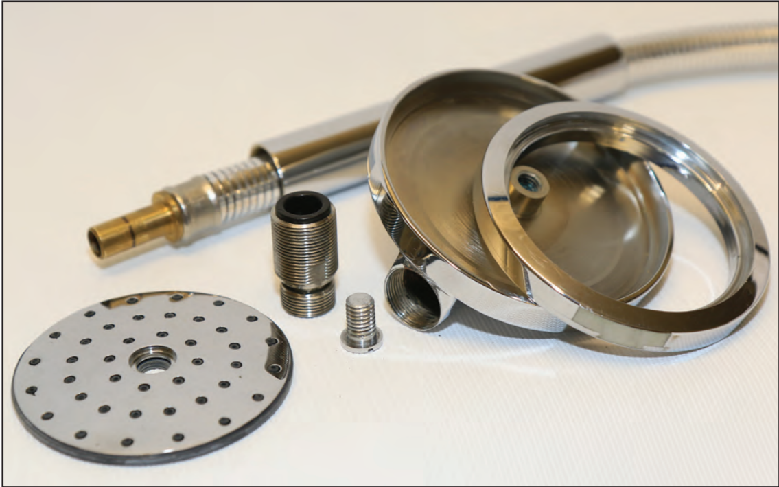
Initial Prototype: Machined Brass, Standard Push-Fit Connector & Hose.