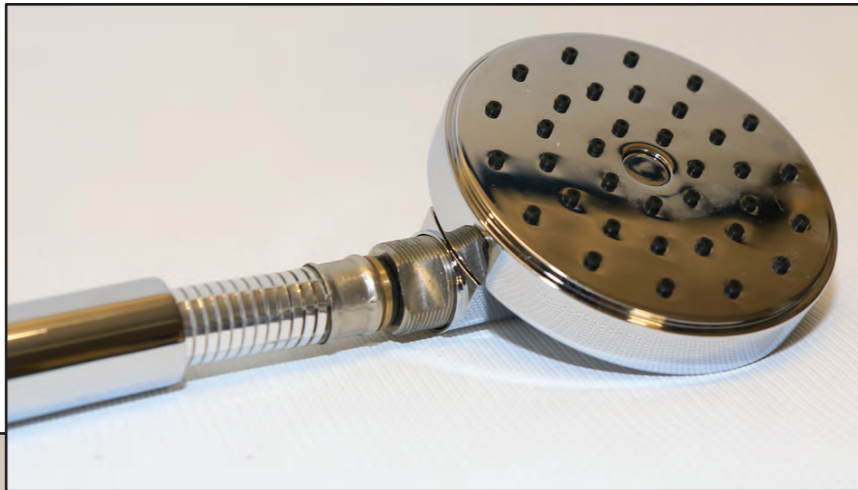
Final design with push-fit mechanism